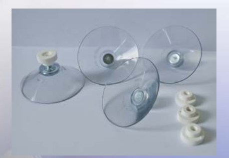
Vacuum cup with screw thread | Item No. B003

Flexibly fix your signs to any smooth surface with our new Vacuum Cups.