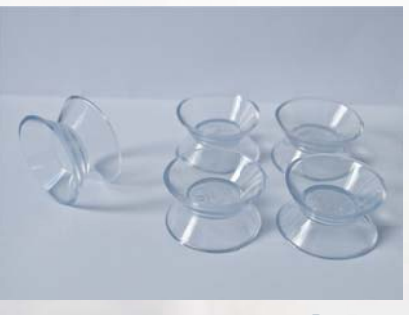
Double Vacuum Cups | Item No. B001